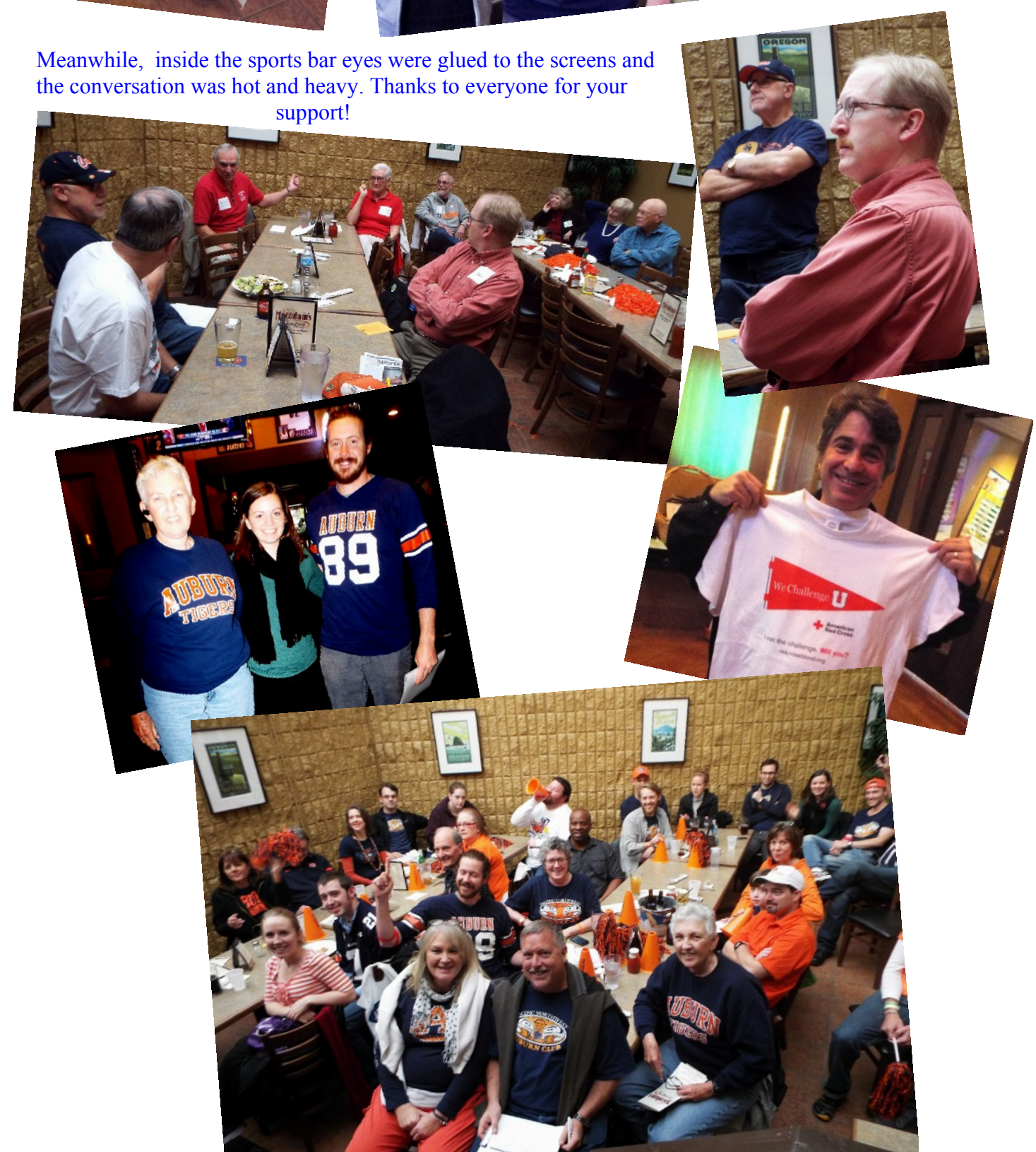
Back to the Stumptown Orange Website.